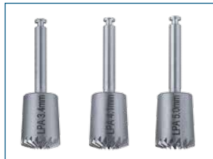
ISO-Latch Bone Profilers