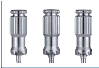
Manual Handheld Bone Profilers