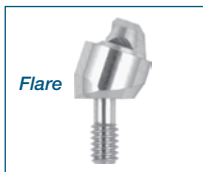
Angled Low Profile Abutment